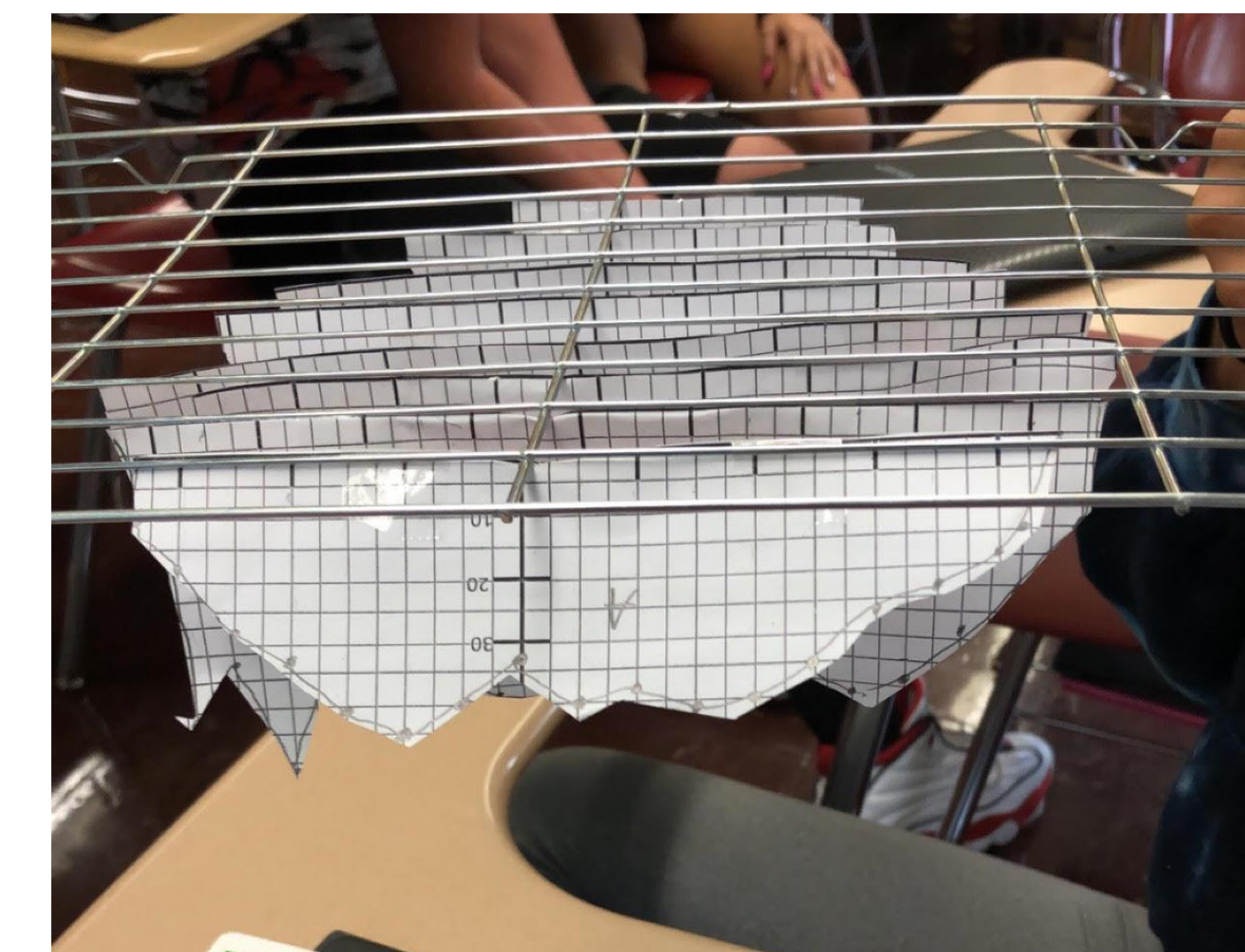
Fig. 4 Student work: a 3D model of the rain garden from the string (baking cooling rack) down to the ground (cut edge of graphs).