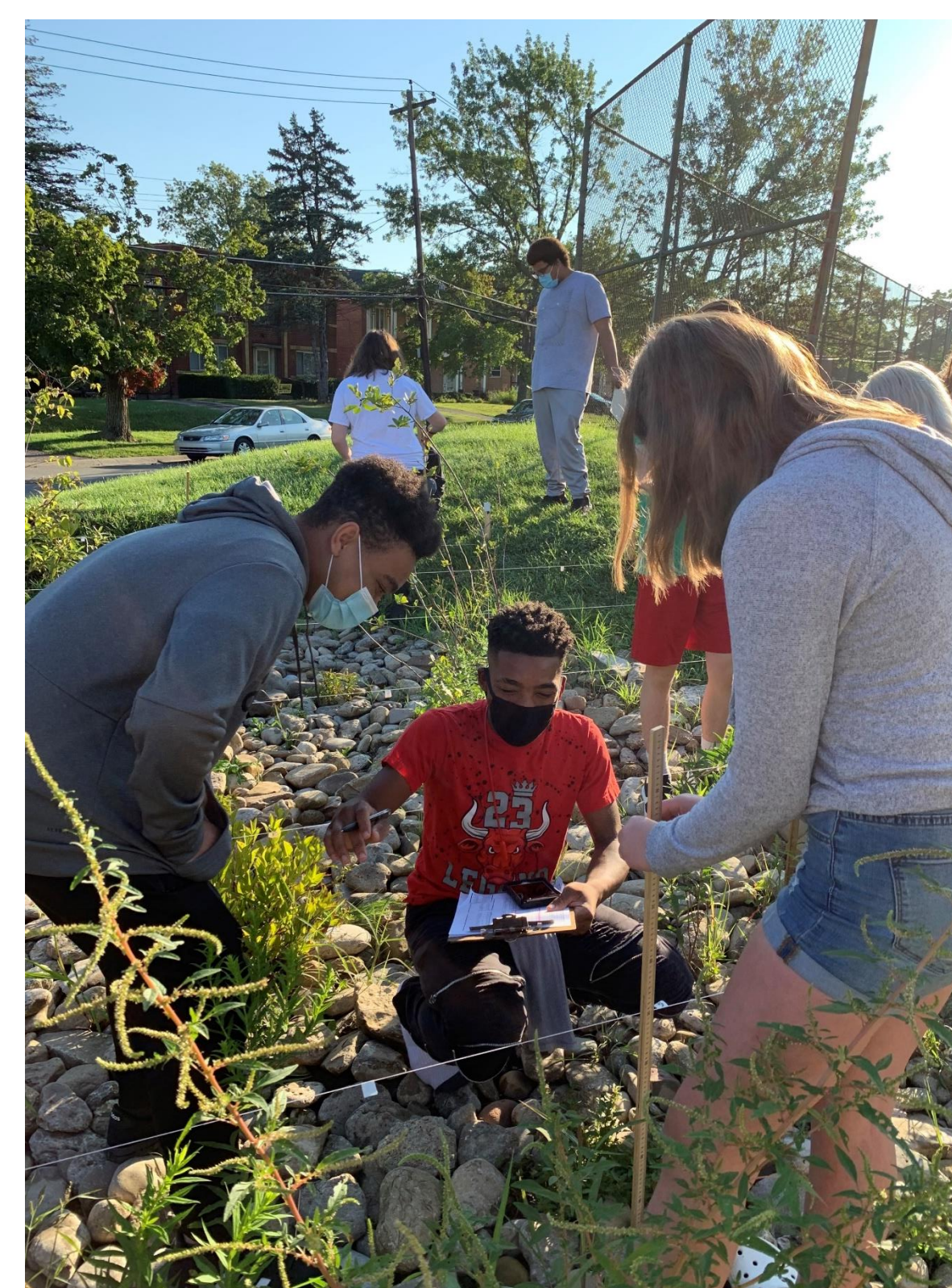
Fig. 3 Students surveying the rain garden. Measurements were taken from the ground up to the string that was at a consistent height across the rain garden.