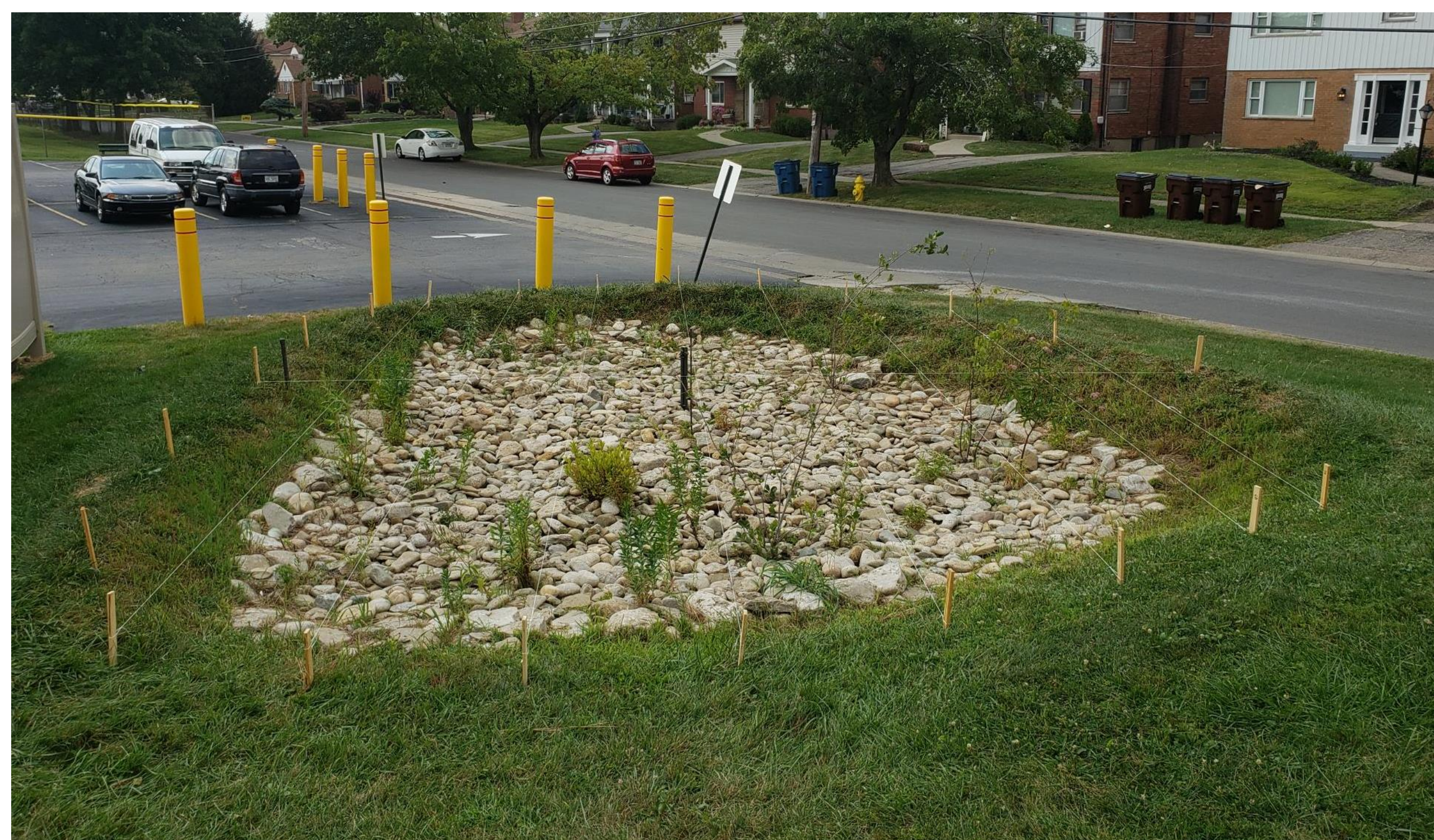
Fig. 1 The Deer Park High School rain garden. Stakes were placed around the perimeter and across the rain garden to create 8 transects. White string was attached to the transect stakes so the string remained at a common elevation from which students could measure.

This initial effort laid the foundation to develop additional physical science curriculum materials linked to the rain garden including hydrogeologic skills such as analysis of staff gauge data, rain gauge data, and soil percolation tests.