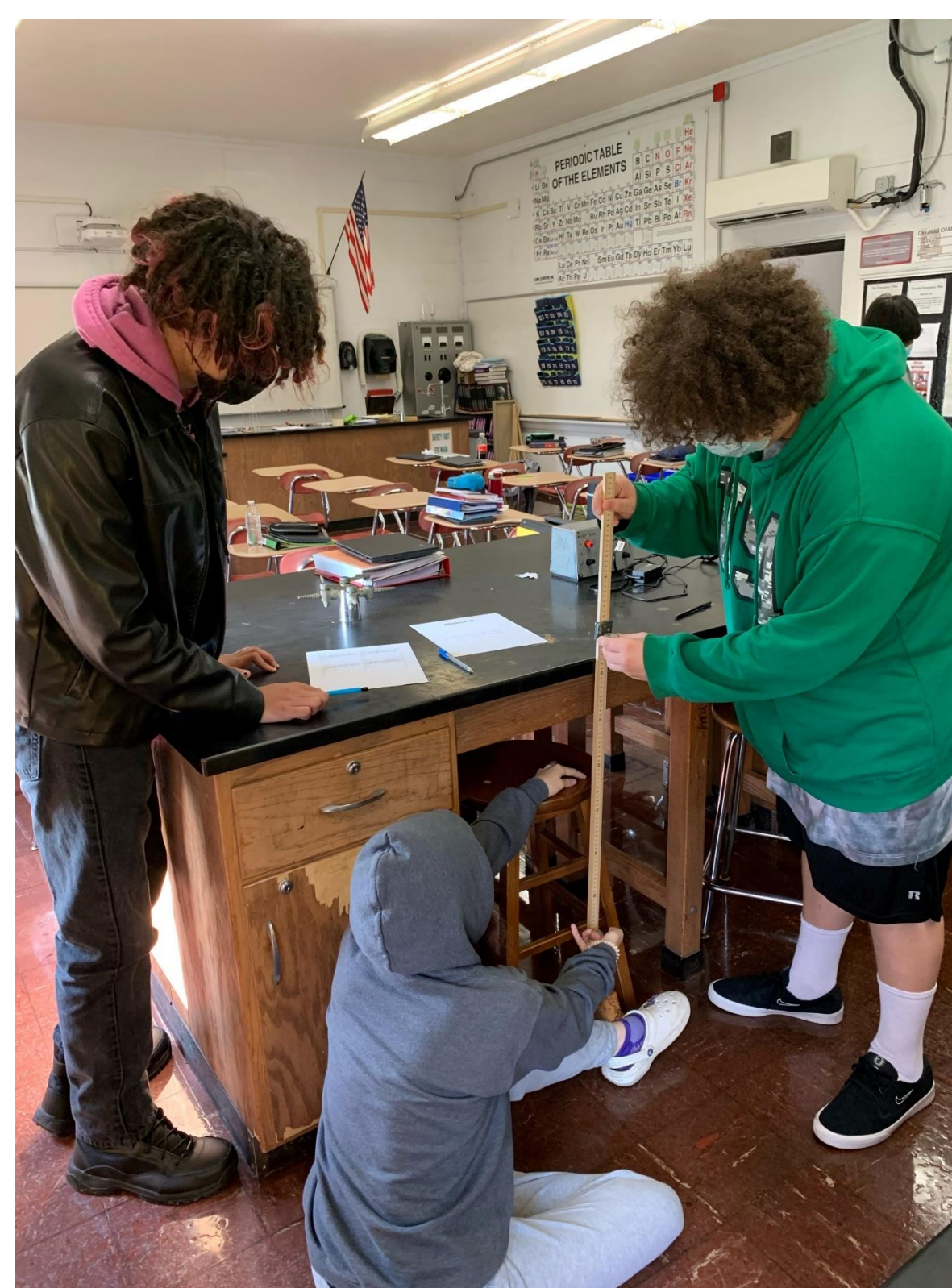
Fig. 2 Students practicing the modified surveying procedure using meter sticks and bubble levels.

The students were tasked with determining how much water the rain garden could capture and divert from nearby storm drains. They were introduced to surveying and practiced a modified surveying method in the classroom using metersticks and bubble levels. The next day the classes conducted an elevation survey for a reference grid established within the rain garden.